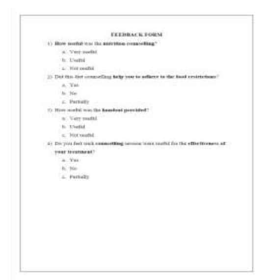
Fig. 3. Feedback form provided to the Hemodialysis patients