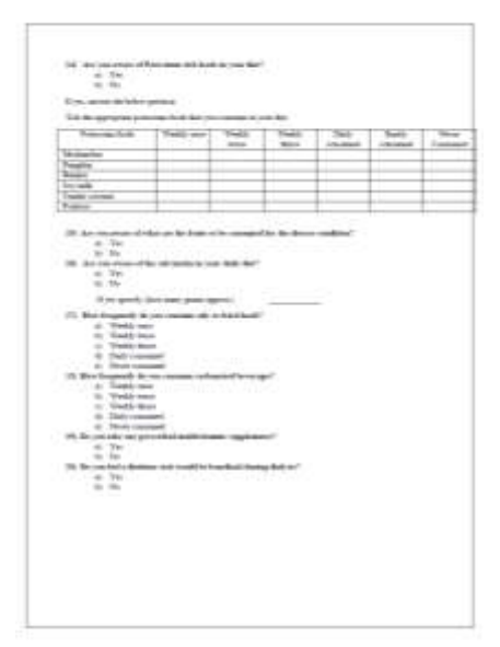
Fig. 1. Questionnaire for the Hemodialysis subjects

The handouts (Fig. 2) were prepared using KDIGO 2020 guidelines that consist of foods to be included / restricted. The handout was provided to the patients who were not aware and had lack of nutritional knowledge. Thereby, a nutrition counselling was given emphasizing on significance of nutrition for HD patients. Nutritional counselling was also given to the subjects based on their serum levels (potassium, phosphorous and sodium).